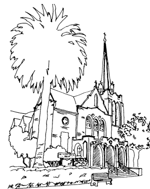
St. Thomas Aquinas Church