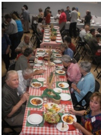
Spaghetti on the table