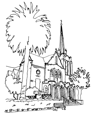
St. Thomas Aquinas Church

The closet with open door and shelves within