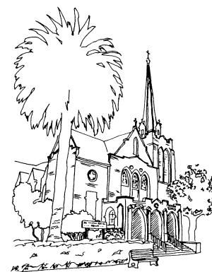
St. Thomas Aquinas Church

Have you read this description of St. Thomas Aquinas church on the parish website ( www.paloaltocatholic.org )? "Started in 1901 and completed in 1902, St. Thomas Aquinas Church is the oldest church in Palo Alto and is a registered historic landmark. Its distinctive carpenter gothic style makes it a signature building for the downtown area. The church is located just three blocks south of University Avenue. At the corner of Waverley Street and Homer Avenue, it's at the northern edge of the historic "Professorville" area of the city."