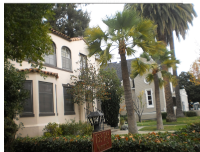
Thomas House & STA church in 2011

Have you read this description of St. Thomas Aquinas church on the parish website ( www.paloaltocatholic.org )? "Started in 1901 and completed in 1902, St. Thomas Aquinas Church is the oldest church in Palo Alto and is a registered historic landmark. Its distinctive carpenter gothic style makes it a signature building for the downtown area. The church is located just three blocks south of University Avenue. At the corner of Waverley Street and Homer Avenue, it's at the northern edge of the historic "Professorville" area of the city."